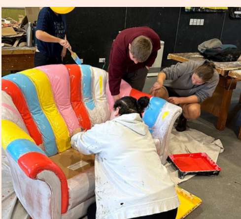
Pictured: Students from Pyramid Hill College and Boort District School