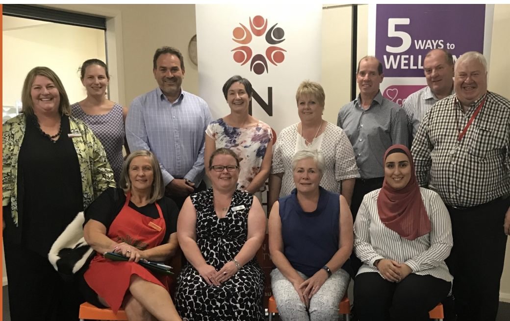
Gannawarra Medical Taskforce participants met again in February at Cohuna NDCH

This is the second time the workforce met with a commitment to working together to attract doctors to the area.